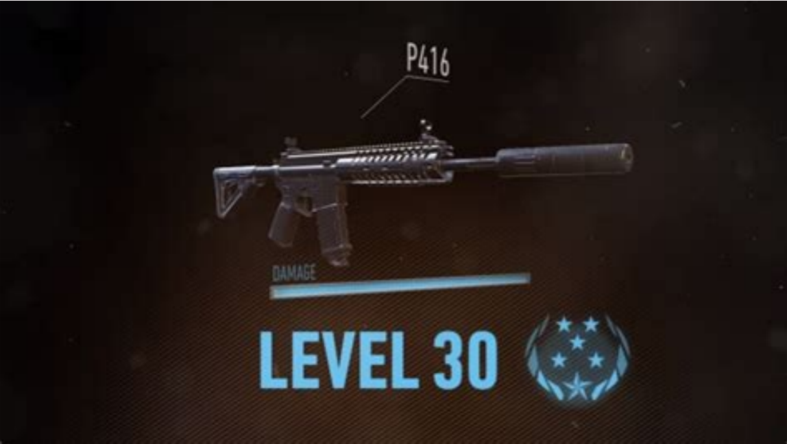
News problems today. ゴーストリコンワイルドランズ lvoa-c bad news. Where to find the lvoa-c bad news. How to get the lvoa-c bad news in ghost recon. News not working.